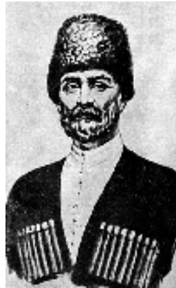
The first modern Circassian historian and folklorist, Shora Negwme preserved many of the legends and tales of the Circassians.